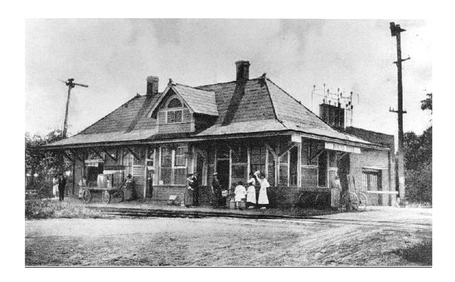
FIGURE 1: ROUND HILL W&OD TRAIN STATION CIRCA 1905

Round Hill Historic District Loudoun County, Virginia