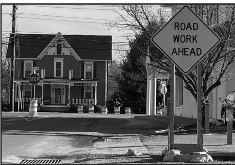
A sign on Main Street warns of construction work ahead.