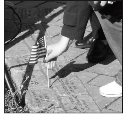
Pavers will be installed around the Town Park flag pole.